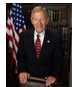
Senator George V. Voinovich

http://voinovich.senate.gov/public/index.cfm?FuseAction=Contact.ContactForm